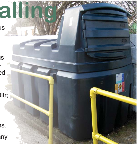
One of the new tanks now being installed by DP FTS

"We can also carry out any necessary building work associated with the installation."